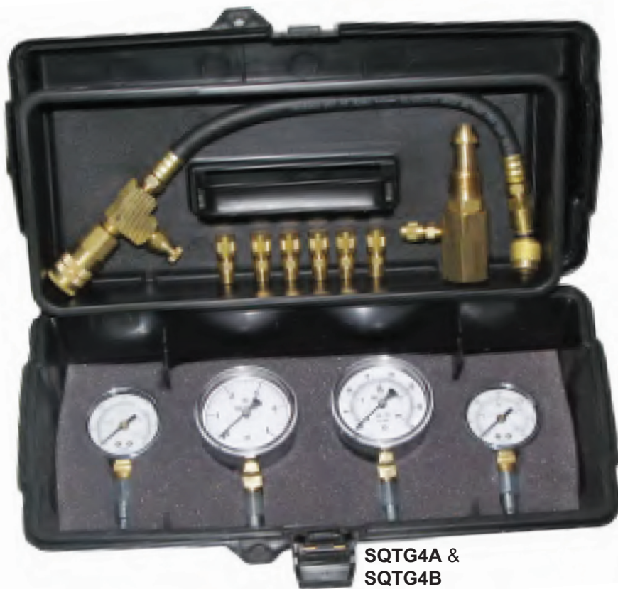
SQTG4A & SQTG4B (Perfect for Servicemen)

The SQTG kits are ideal for bobtail drivers and service personnel that conduct leak check and regulator pressure testing. The SQTG kits contain four pressure gauges: a) 30 psi gauge for pressure tap valves in the outlet of a first-stage regulator, or intermediate pressure of an integral two-stage regulator b) 300 psi (with high pressure test block) for systems with no regulator pressure taps c) 5 psi gauge for testing set and lock up pressure in 2 psi regulators d) 35" WC gauge for use in second-stage regulator leak testing