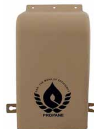
Rubber Meter Cover