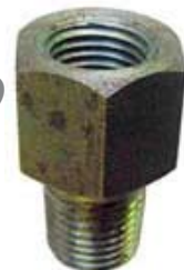
Pressure Gauge Snubber