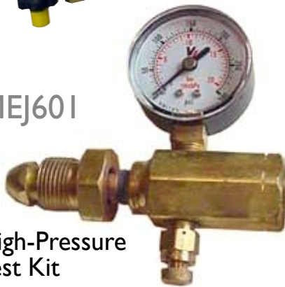
High-Pressure Test Kit