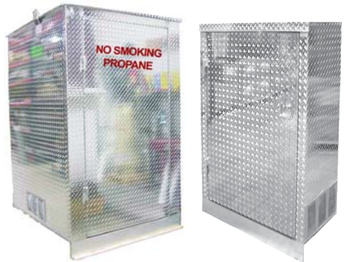
DISPENSER KIT TALL ALUMINUM