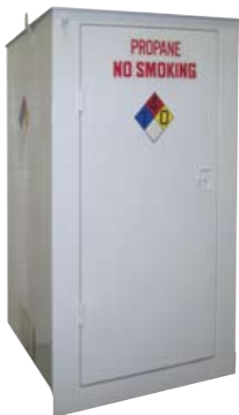
DISPENSER KIT TALL