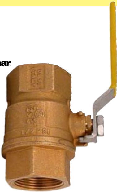
R250 | 1 1/4

Jomar 'Full Port' Ball Valves 'Economical - Good All Purpose Propane Valve'