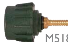
M518 - 25H