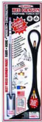
VT2 1/2 24CE