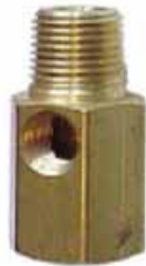
MEJ595 Pressure Gauge Adapter