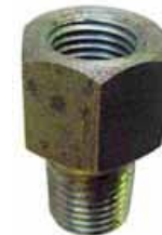
I499 Pressure Gauge Snubber

Note: Side has #54 drill hole and plugged. This test adapter can be installed anywhere in the system and remains part of the permanent installation.