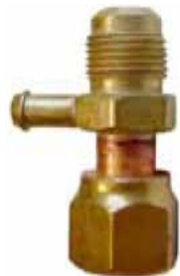
Low Pressure Test Adapter