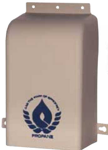
Rubber Meter Cover