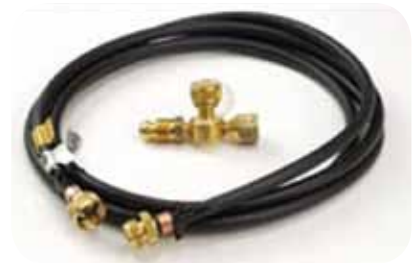
MER470 Flow Longer Propane Adapter Kit w/ 42421-144 Appliance Hose and G415 Tee