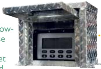
Locking hose and meter boxes

In addition, Bergquist is the industry leader in dispenser training and our knowledgeable propane veterans are always only a phone call away. Call now at 1 800 537 7518.