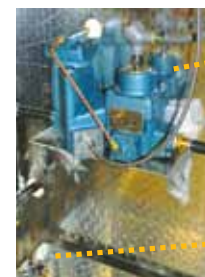
Neptune 1" meter