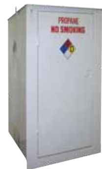
DISPENSER KIT TALL