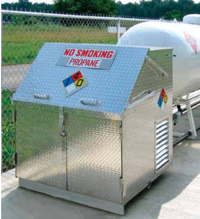
Corken C12 Pump with IHP Motor