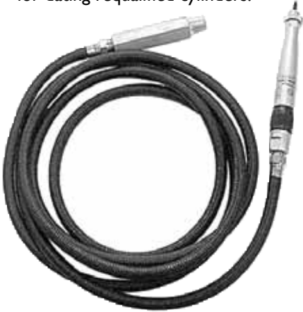
Chicago Pneumatic Air Scribe

Air operated light weight tool for dating requalified cylinders.